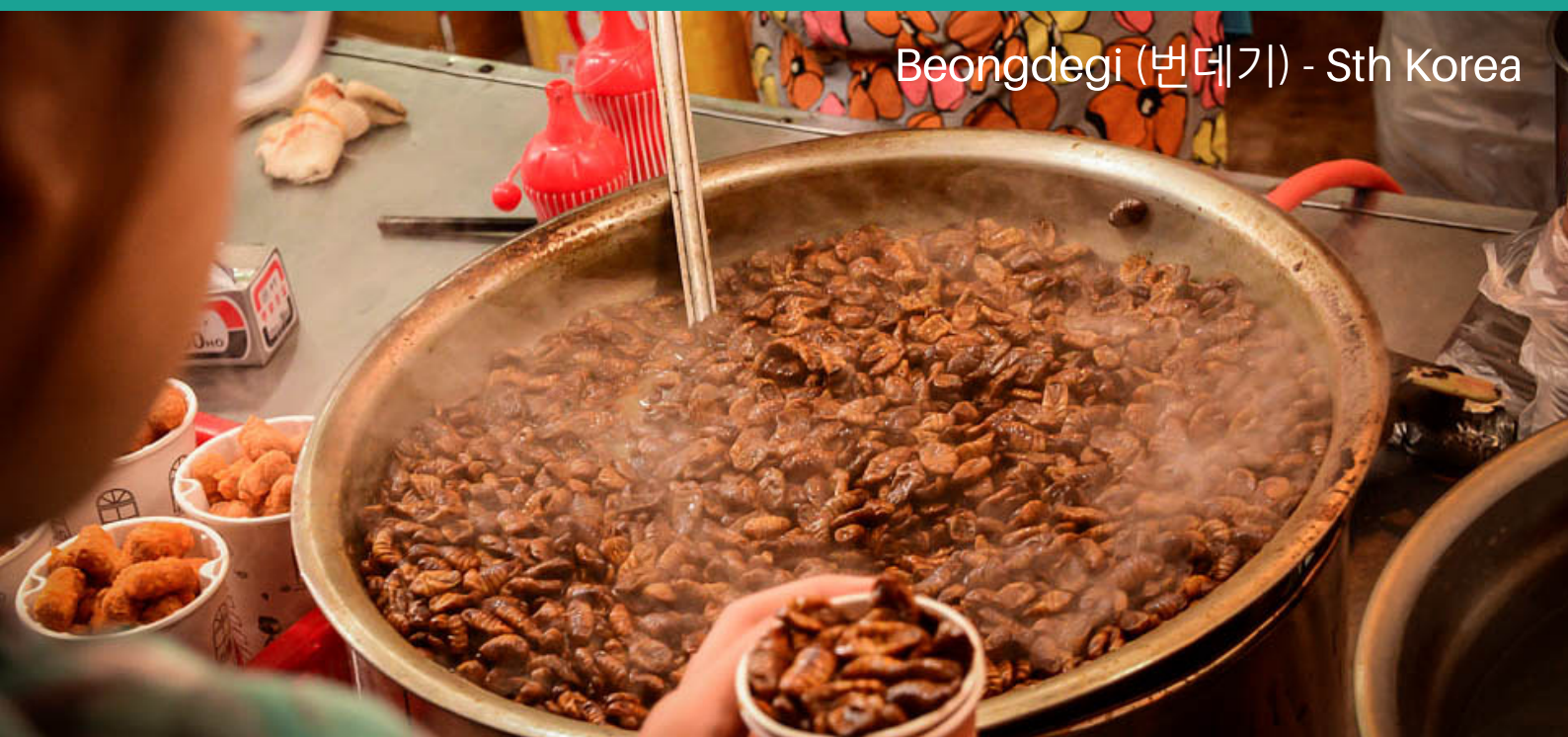
Beongdegi (번데기) - Sth Korea

Weird and Wonderful Foods of the World. Not everything looks palatable. We are willing to put our palates and stomachs on the line to try some of the stranger traditional foods.